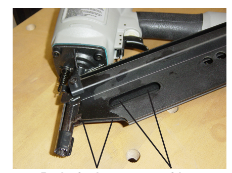
Probe in these areas with a screwdriver to release jammed nails.

If you are unable to clear the nail jam using the method prescribed above, the tool should be taken to a qualified service technician for proper servicing.